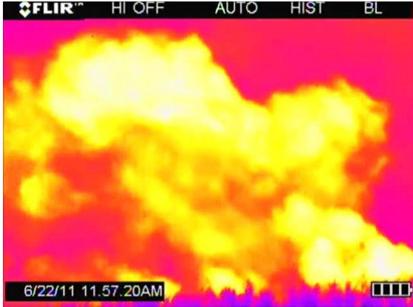
Figure 1. Venting of natural gas into the atmosphere at the time of well completion and flowback following hydraulic fracturing of a well in Susquehanna County, PA, on June 22, 2011. Note that this gas is being vented, not flared or burned, and the color of the image is to enhance the IR image of this methane-tuned FLIR imagery. The full video of this event is available at http://www.psehealthyenergy.org/resources/view/198782 .